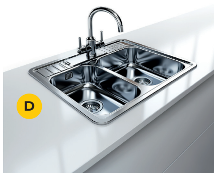
ACCESSORIES (SINK, GARBAGE BINS, TAPS, SPACE SAFERS, ETC)