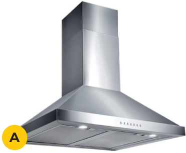
APPLIANCES( HOOD, MICROWAVE, FRIDGE, OVEN, HOB(GAS/ELECTRIC ETC.